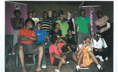
Discovery Of Individual Abilities Within Our Young Leaders

In partnership with Computershare's Change a Life programme, Valued Citizens Initiative believes that leaders are born and developed but need to be revealed through persistent yet patient nurturing. But for a leader to be revealed s/he has to be dedicated in establishing him or herself as a leader, and be guided and developed to show their abilities.