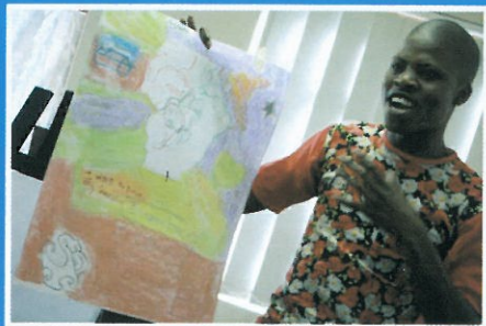
Explaining My Life