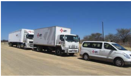
Supply chain solutions that REALLY deliver.. anywhere!