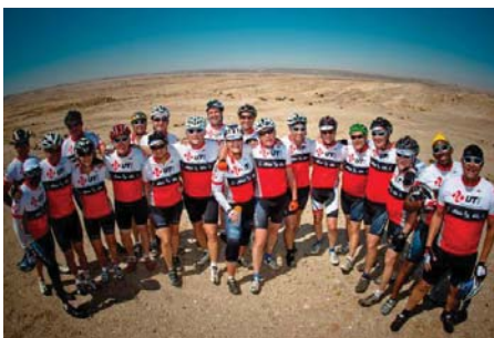
Geared up and ready for the challenge!