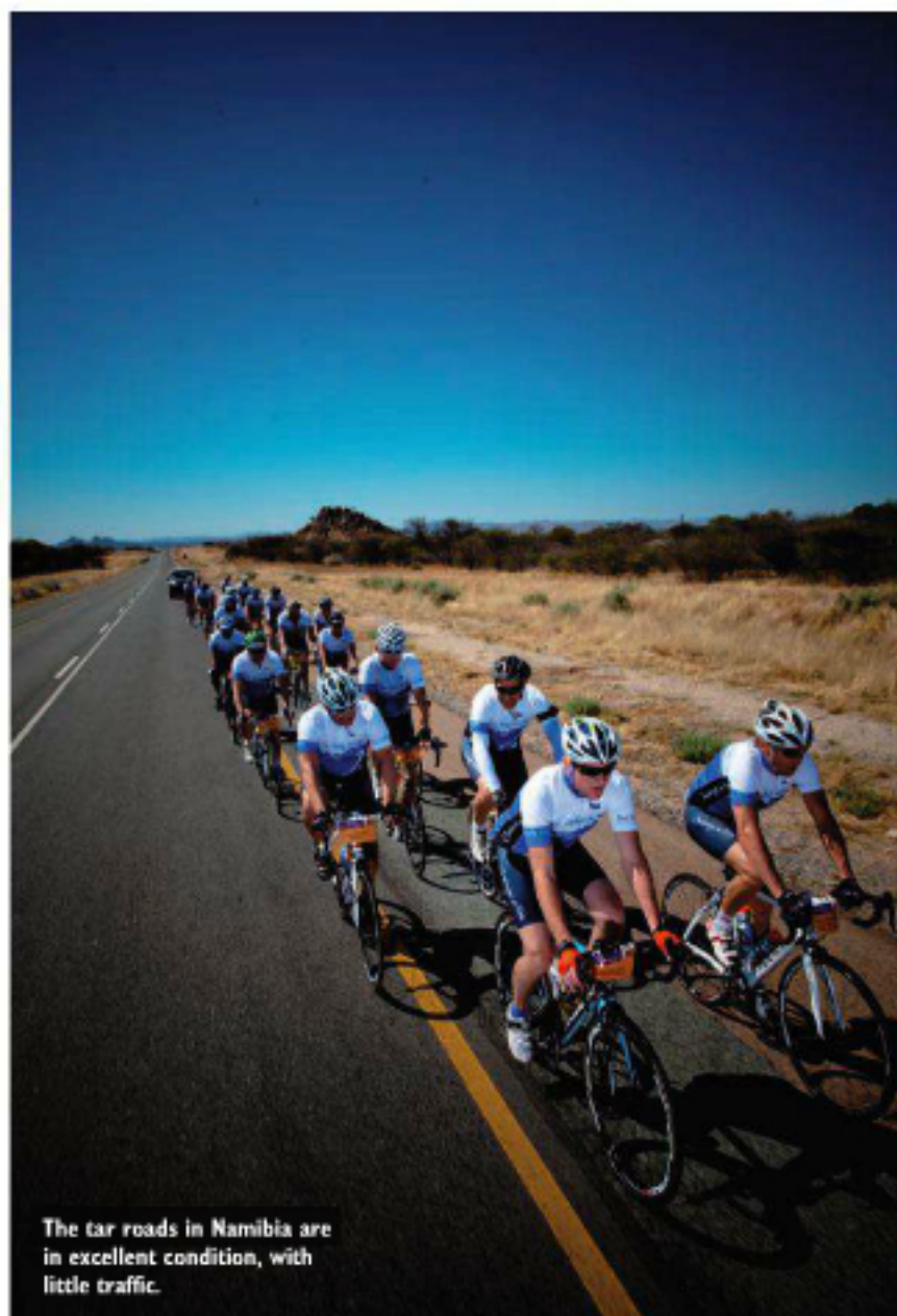
The tar roads in Namibia are in excellent condition, with little traffic.